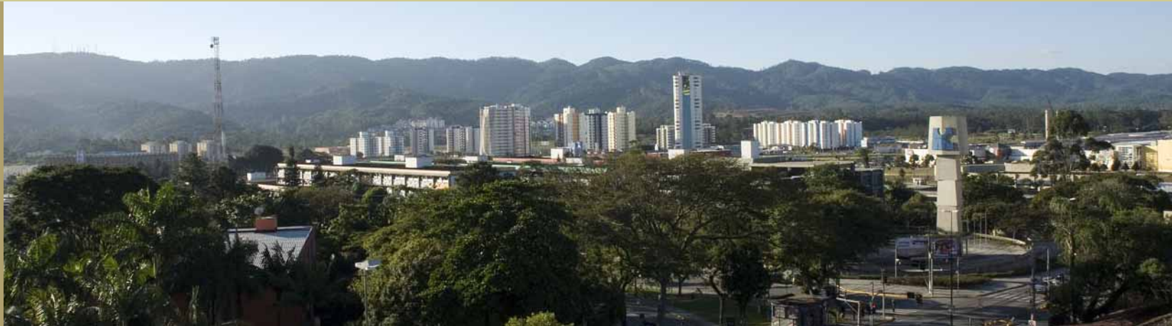
View from the 6th floor of Andari, Nagib and Marins Corporate Law Firm's office

Andari, Nagib and Marins Corporate Law Firm • OAB/SP 7.211 • CNPJ 05.515.803/0001-00 Dr. Ricardo Vilela street, 1313, 5th and 6th floors, Centro, Mogi das Cruzes (SP), Brazil Phone: +55 (11) 4796-1194 • 4799-8900 • e-mail: anm@anm-sociedade.adv.br • www.anmjuridico.com.br